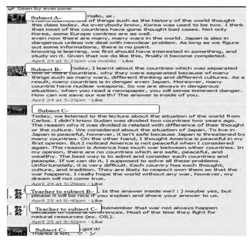
Picture 1 Interaction between teacher and students (subjects A, B, C).